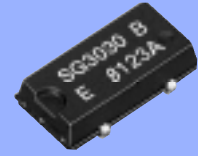
SG-3030JC SG-3040JC SG-3032JC